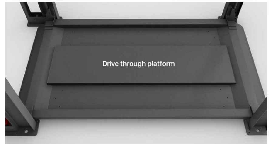
▶ Easy Drive-Through Platform